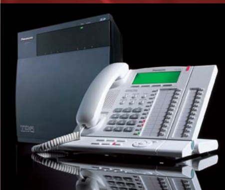
KX-TDA hybrid IP PBX